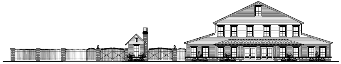
114-016 PROPOSED FRONT VIEW