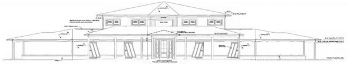
FRONT VIEW SCALE 1/8" = 1'-0"